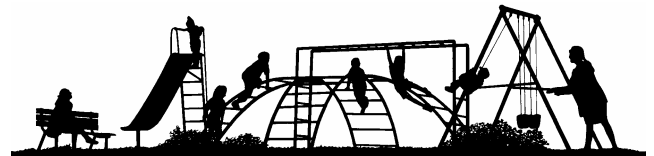
First Friends Playgroup