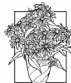
REMEMBER TO PRAY FOR...