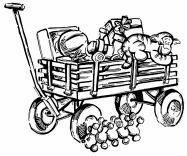
Used Toys and Games Drive

The High School Walkin' the Talk Class is collecting used toys and games for this holiday season for those children less fortunate. Please help, by cleaning out those closets and bedrooms