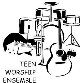
TEEN WORSHIP ENSEMBLE