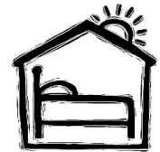
HELPING HANDS HOMELESS SHELTER