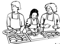
Food for the Homeless