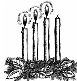
Third Sunday in Advent

Church of the Little Flower, for the 14 th year, is sponsoring the Advent Novena. The Novena (Latin for nine) begins at 6:15pm each night, December 15 th through December 23 rd , in the Chapel. Each night there is time for song, prayer and reflection. It lasts about forty minutes and is a great way to end the day. You do not have to be able to attend all nine sessions in order to participate. What a wonderful way to get a prayerful break from the usual busy-ness of this time of year.