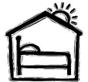
HELPING HANDS HOMELESS SHELTER

NOTE: If your child is being Confirmed, this would be a great Community Service Project for them. Thanks in advance for making a difference in the lives of those who are less fortunate.