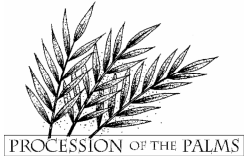
PROCESSION OF THE PALMS

March 9 - 2:00pm at The Cathedral, Springfield 4:00pm at St. Cabrini, Springfield 4:00pm at St. James, Riverton March 11 - 6:30pm at Sacred Heart 6:30pm at St. Joseph, Chatham March 13 - 7:00pm at St. Agnes Sacramental Penance is also available at 4:30pm every Saturday, St. Jude Church